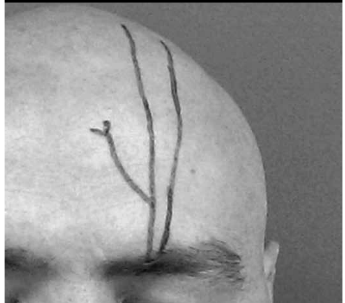
Figure 1. Supraorbital nerve is a branch of the V1 ophthalmic division of the trigeminal cranial nerve (CN V). It passes through the supraorbital foramen to innervate the forehead, extending to the mid scalp.

After three treatments with Neural Prolotherapy she experienced complete resolution of her V1 branch trigeminal neuralgia. At the point of the submission of this paper 1 year had passed without the return of pain. She reports the ability to brush her hair without pain and overall improvement in quality of life and her ability to perform activities of daily living. She continues to seek occasional osteopathic manipulation for cervicalgia, but continues to report her neuralgia as completely resolved.