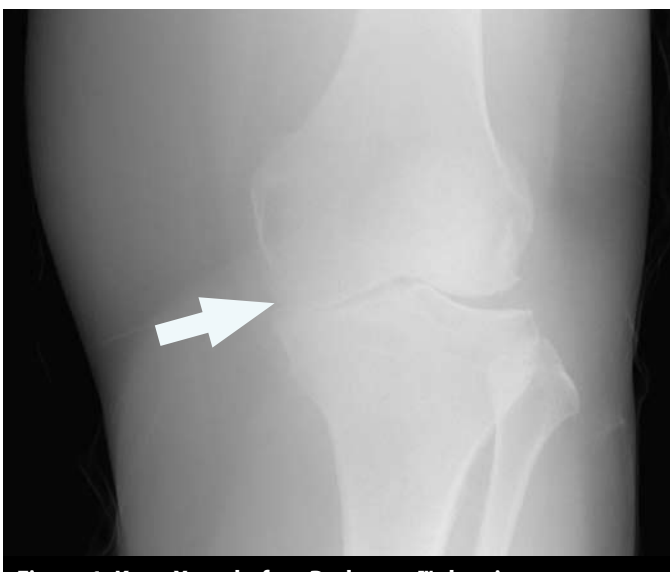
Figure 1. Knee X-ray before Prolozone™ showing severe medial joint space narrowing.